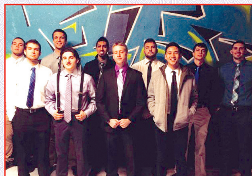
Members of the new spring pledge class.