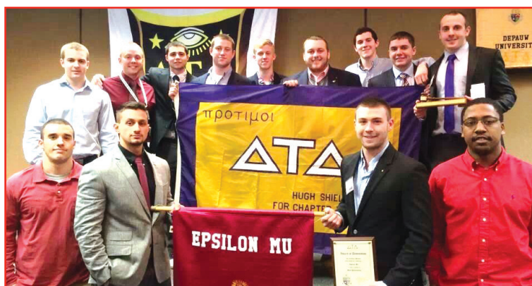
Chapter officers accept Epsilon Mu's 13th Hugh Shields Award for Chapter Excellence at the Northern Division Conference in Merrillville, Indiana.

Joining your brothers to help us build for the next generation of Delts is a great way to give back just a little of what the ΔΤΔ experience gave to you. Your pledge will show your continued commitment to our undergraduate brothers, fellow alumni, and the promises you made at your initiation into our beloved fraternity.