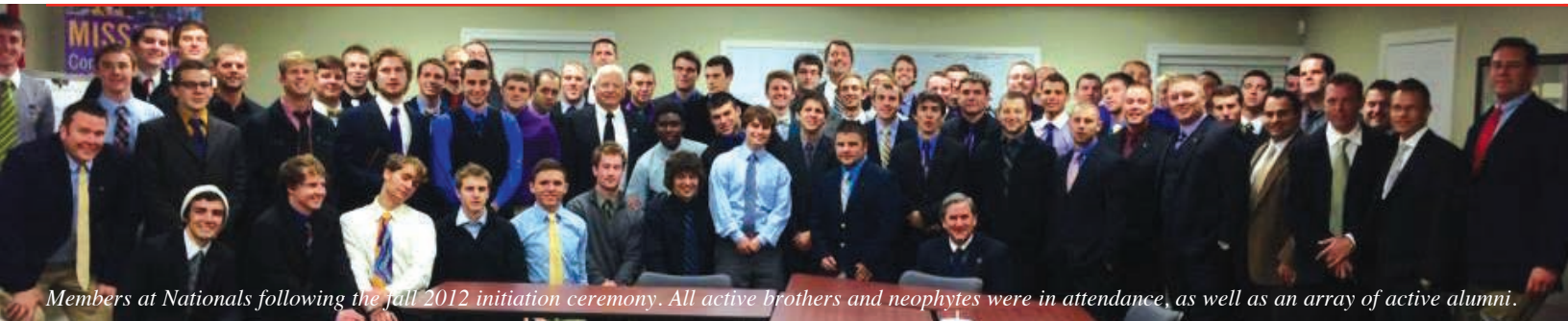
Members at Nationals following the fall 2012 initiation ceremony. All active brothers and neophytes were in attendance, as well as an array of active alumni.