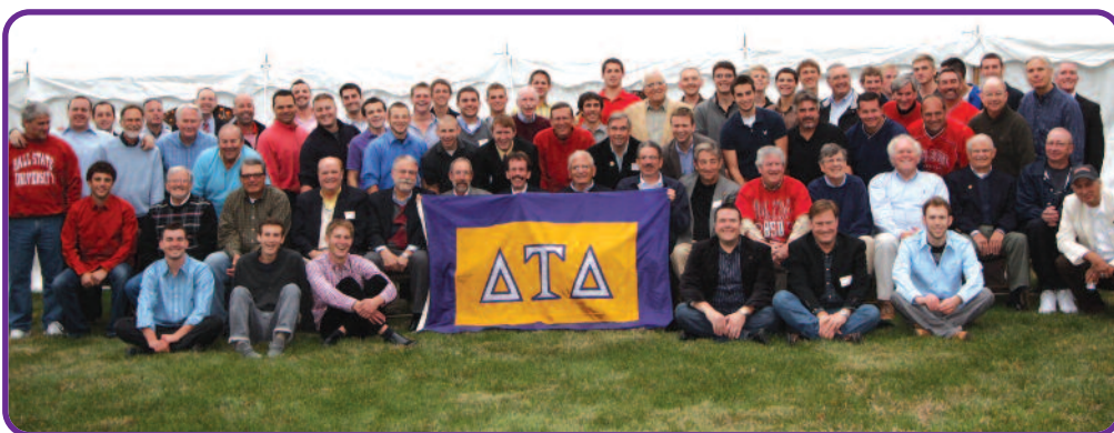
Alumni gather for the 45th anniversary banquet.

Attention: This newsletter is intended for alumni and parents. If your son is still attending Ball State University, he will receive a copy at the chapter house. If he has graduated, please send us his permanent address to update our records. Thank you.