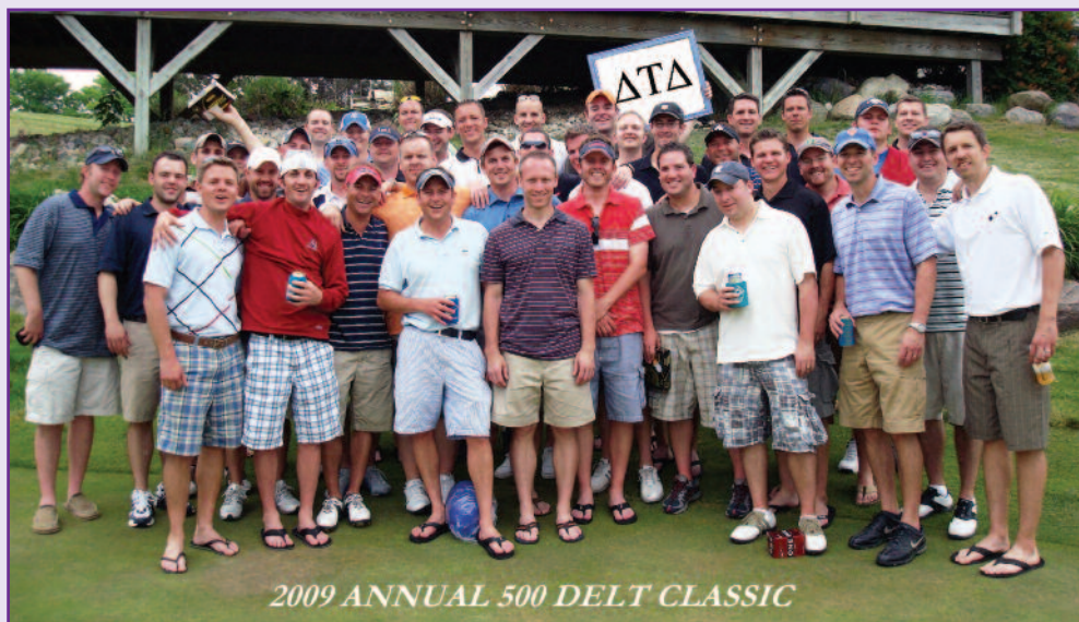
Graduates from the mid-1990s to early 2000s enjoyed the 2009 Indy 500 Delt golf outing in July. Join us July 24 for the next alumni golf outing!