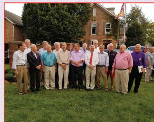
Eighteen ΔΤΔ charter members attended the celebration.