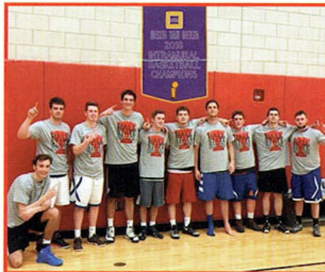
Brothers after winning the intramural basketball championship!