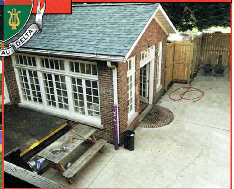
The Shelter courtyard.