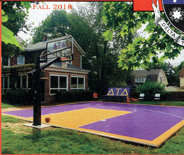
Newly renovated basketball court with Delta Tau Delta themes.