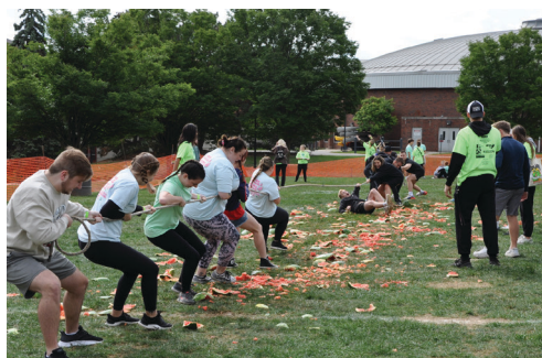
Smashing watermelons to raise money for a good cause is a win-win!