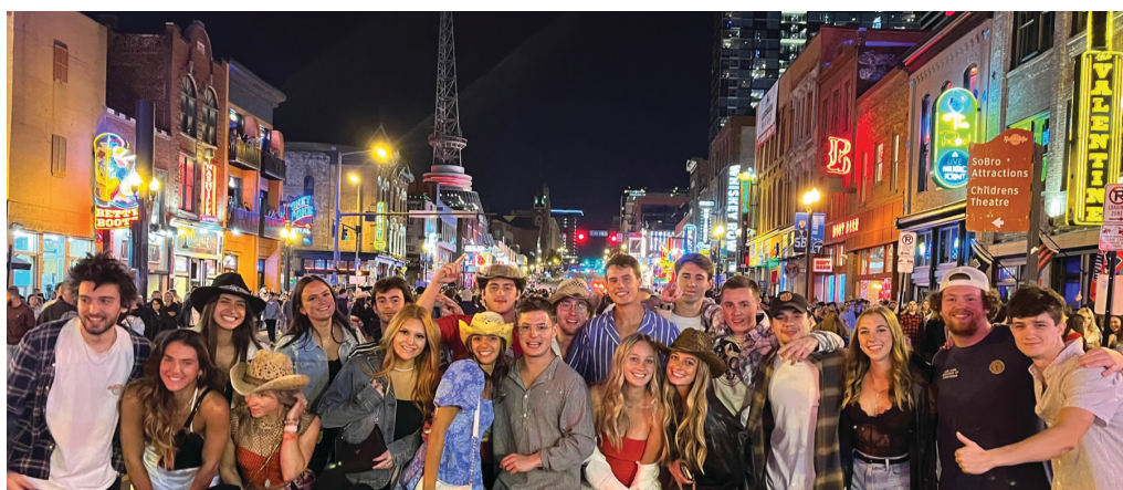
What better place to dance the night away than in Nashville?