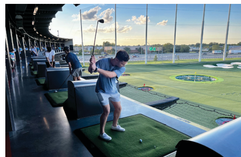
Brothers showing off their skills at Top Golf.