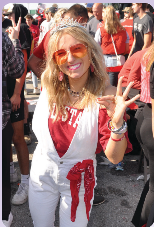
Our sweetheart has made such an impact this year!

Attention: This newsletter is intended for alumni and parents. If your son is still attending Ball State University, he will receive a copy at the chapter house. If he has graduated, please send us his permanent address to update our records. Thank you.