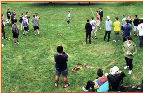
Brothers hosted a flag football tournament at the Shelter with eight other fraternities.

This spring we had a pledge class of five men. This lower number is on trend due to changes across the campus, as the highest number of new members taken on campus was eight by another chapter. We are excited for these young men to join Epsilon Mu!