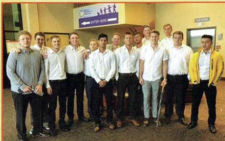
Members volunteered as valet at Rialzo.