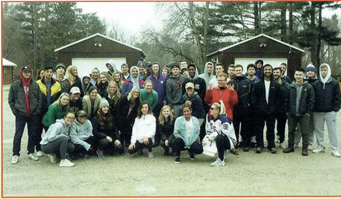
EM and Alpha Phi participated in a community service project at Camp Adventure.