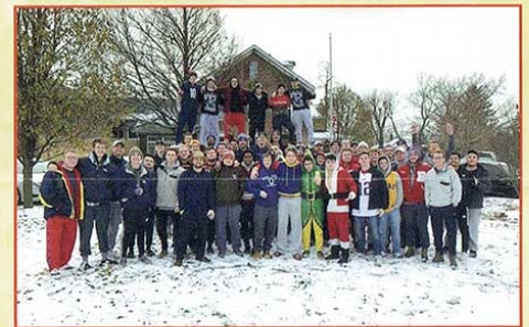
Christmas card to our families.

This past February, we hosted the Northern