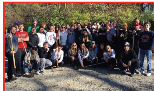
We had a blast at our camp adventure community service event with the women of Delta Zeta!